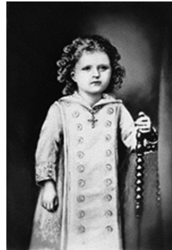
St. Thérèse—age 8

"Jesus is in paradise and it is there your heart should dwell."